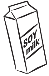
Unsweetened soy 'milk'